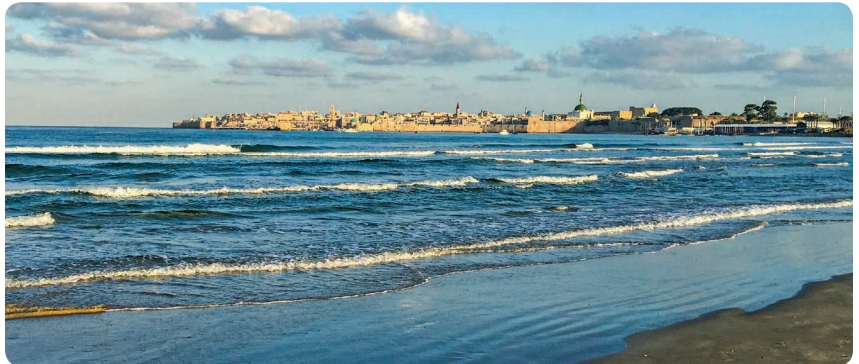
The conference venue provided beautiful views of the ancient city of Akko.