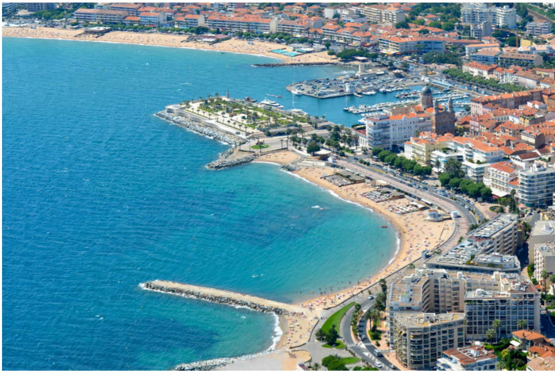
The town center of Saint-Raphaël