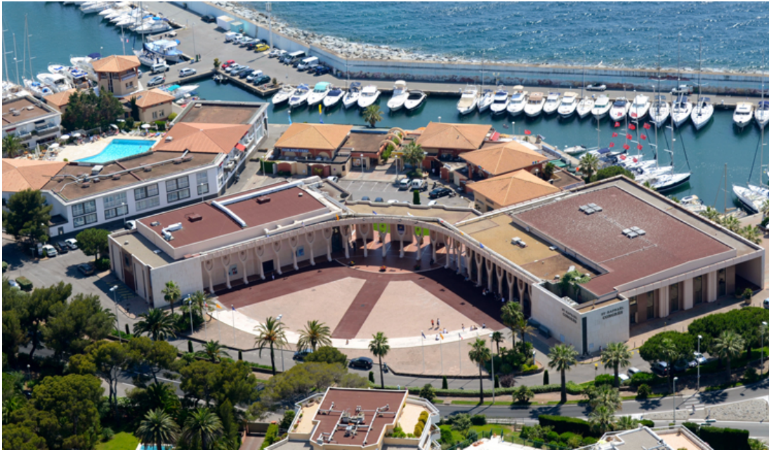
The Congress Center of Saint-Raphaël